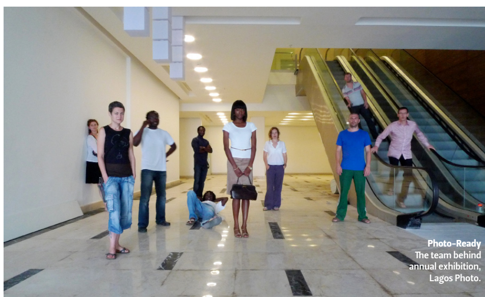
Photo-Ready The team behind annual exhibition, Lagos Photo.